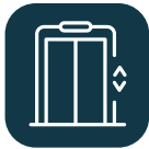
L PRIVATE LIFT 5'X6'