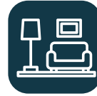
J LIVING ROOM 12'X20'