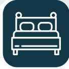
D BEDROOM 12'X15'