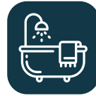
H BATHROOM 5.6'X7'