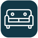
I DRAWING 12'X16'