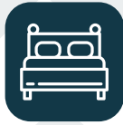
B BEDROOM 11'X13'