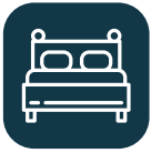
A BEDROOM 11'X14'