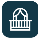
M TERRACE 12'X4'