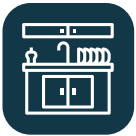
K KITCHEN 8'X13'