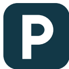
P PARKING 11'X16' 2.5'X5'