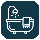
E BATHROOM 6'X7'