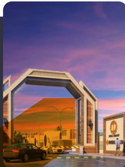
GATED BOUNDARY WALL